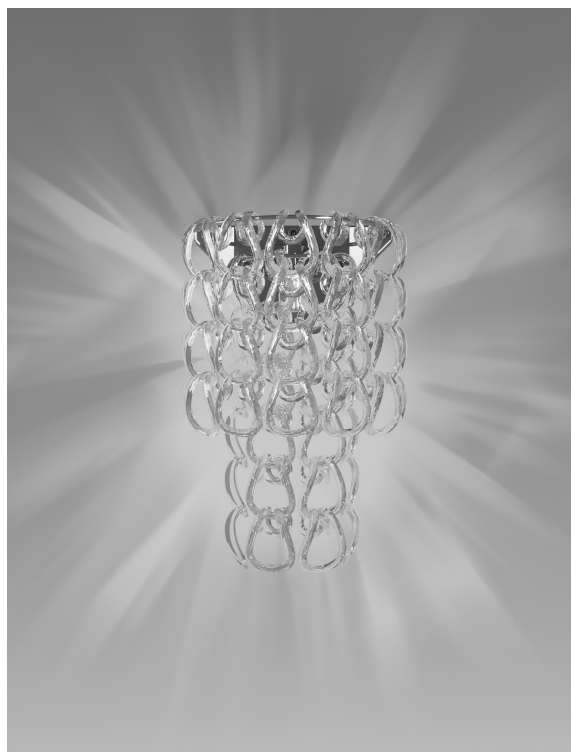
GIOGA AP CRTR CR 14E CE