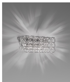
GIOGA AP 2